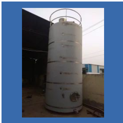
Stainless Steel Milk Silo