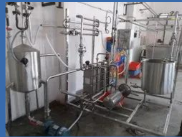
Mini Dairy Plant