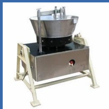
Paneer Making Machine