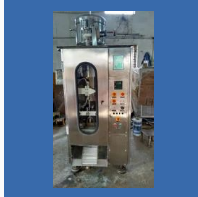
Automatic Milk Pouch Packing Machine Single Header With Range 200,500,1000 ML