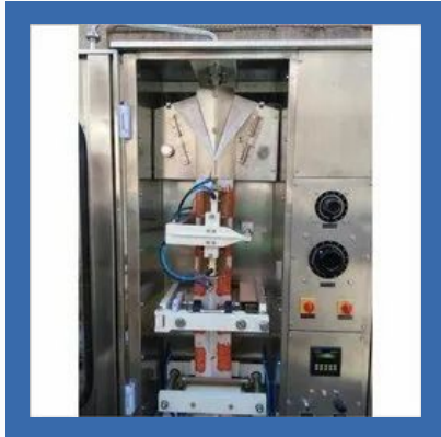
Milk Pouch Packing Machine