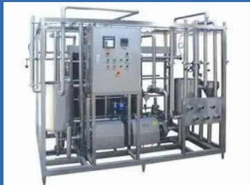
Milk Pasteurization Machine