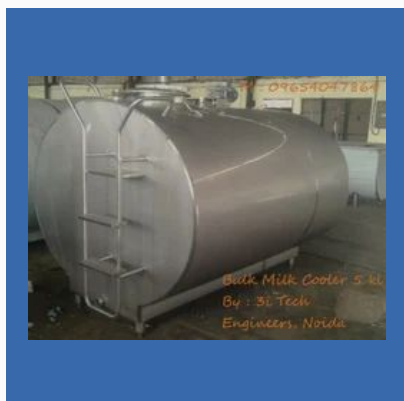
Bulk Milk Cooler 3 KL