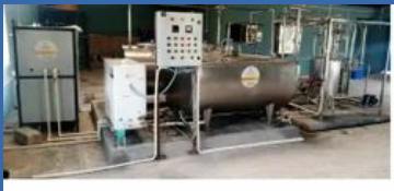
Mini Dairy Plant 200 LPH