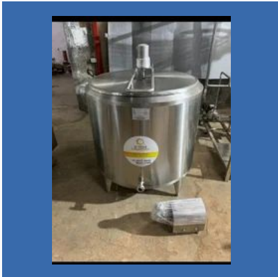
Bulk Milk Cooler 500 Liter