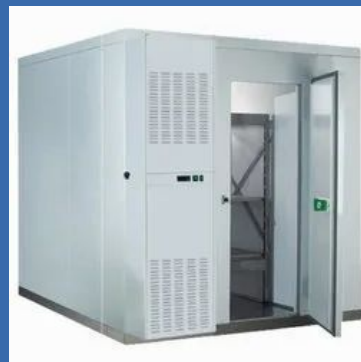
Milk Storage Cold Room