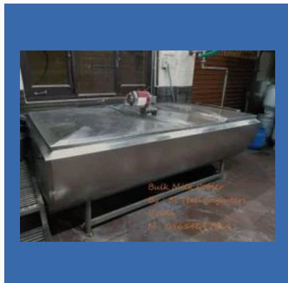
Bulk Milk Cooler 2 KL