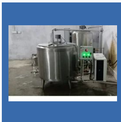
3i Tech Bulk Milk Cooler 300 LITRE