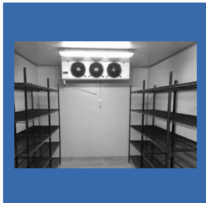
Modular Cold Rooms