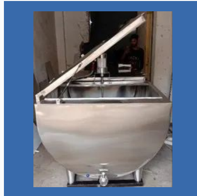
1000 Liter Bulk Milk Cooling Machine