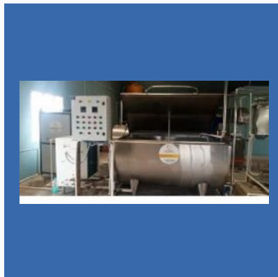
3i Tech Bulk Milk Cooler 1 KL