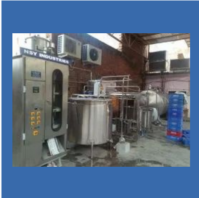
Milk Processing Plant and Machines