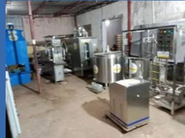
Automatic Mini Dairy Plant 300 LPH Pouch, Bottling