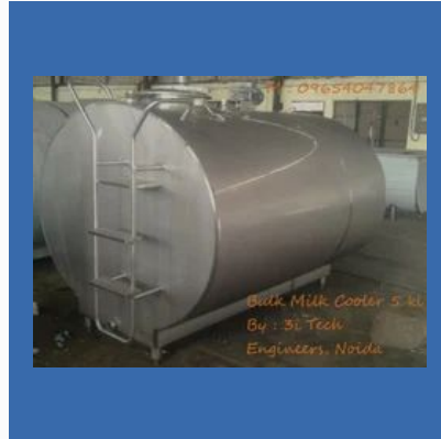
Bulk Milk Coolers 5kl