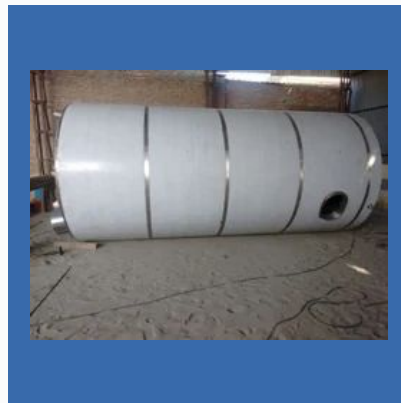
SS304 Milk Silo