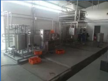
Dairy Processing Plant