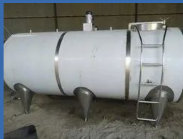
Milk Storage Tank 5000 Litre