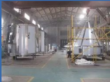
Milk Powder Processing Plant